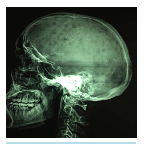
Figure 1. Lateral radiograph of skull showing several lytics lesions.

MM is a malignant disorder which is characterized by the proliferation of monoclonal plasma cells [2]. The peak incidence of MM is in the seventh decade, whereas, it is a rare entity in young patients, with less than 2% cases